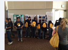
CCI Student Forum 2012

SciJourn and CCI aim to build flexibility and dialogism into their design. Consistent with the DBIR principles, we believe that worthwhile ideas are more likely to be sustained when the core intervention is flexible and responsive to varied contexts, local actors understand the relevant principles, and researcher-practitioner networks facilitate ingenuity, critical reflection, and adaptation. Such interventions are marked by an ongoing commitment to iteration and dialogue.